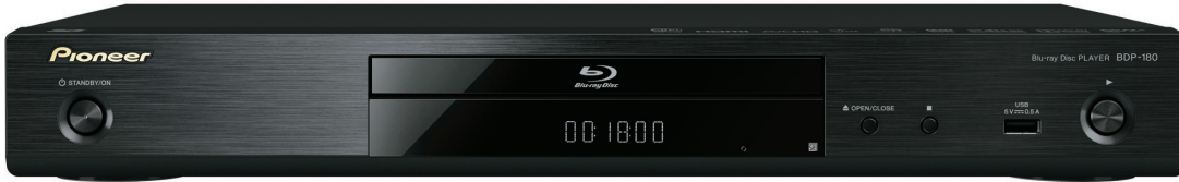
BDP-180-K (black model)