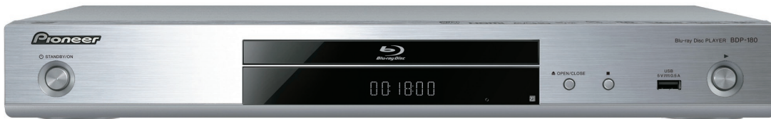
BDP-180-S (silver model)