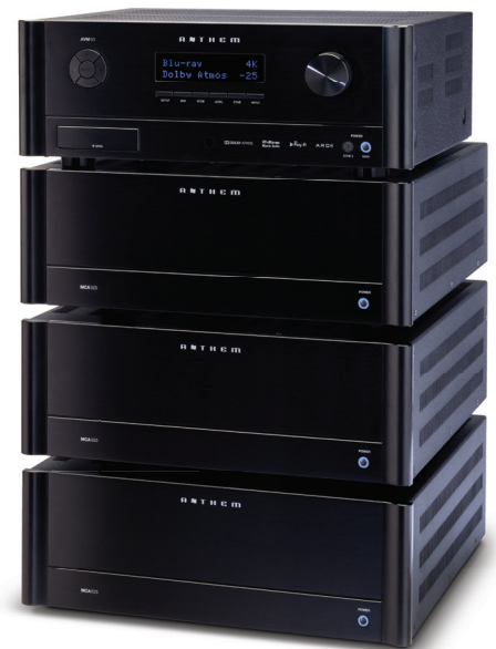
Two MCA 325s and a MCA 525 teamed with an AVM 60 Preamp

CREATE YOUR OWN DOLBY ATMOS 11-CHANNEL SYSTEM