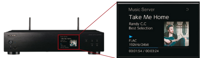
LCD Display with Song Information

* Album artwork may not be available depending on file type