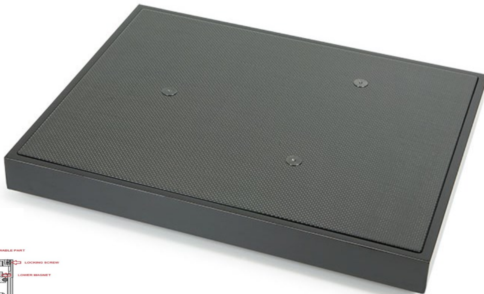
Ground it Carbon magnetic decoupling feet