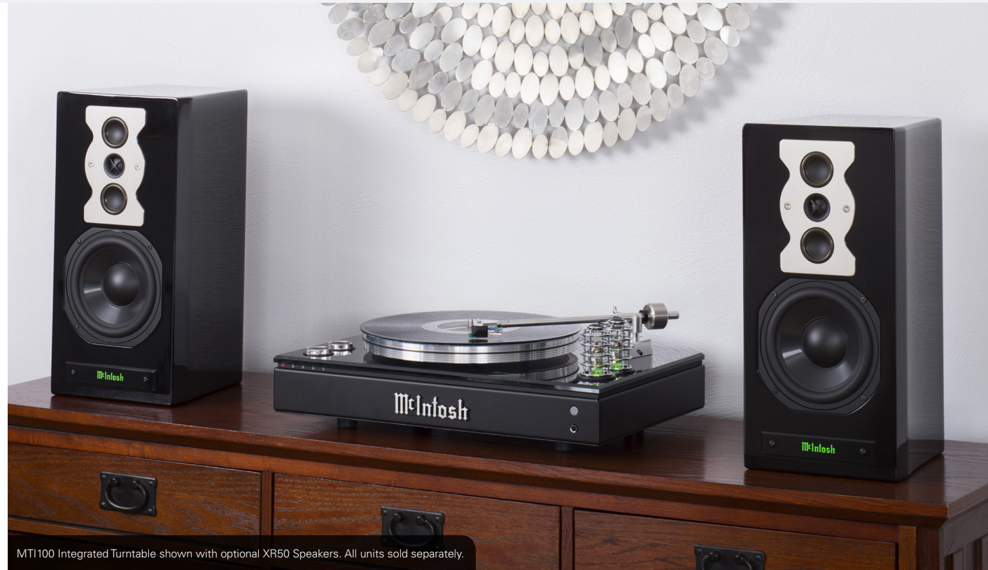
MTI100 Integrated Turntable shown with optional XR50 Speakers. All units sold separately.