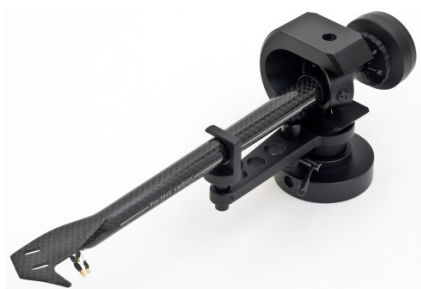
carbon fibre tonearm: Non-resonant tube with low friction bearings